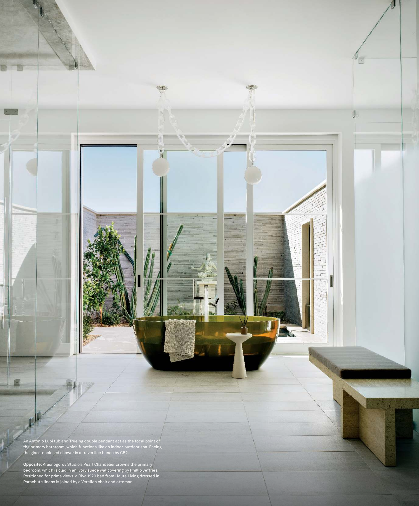
An Antonio Lupi tub and Trueing double pendant act as the focal point of the primary bathroom, which functions like an indoor-outdoor spa. Facing the glass-enclosed shower is a travertine bench by CB2.