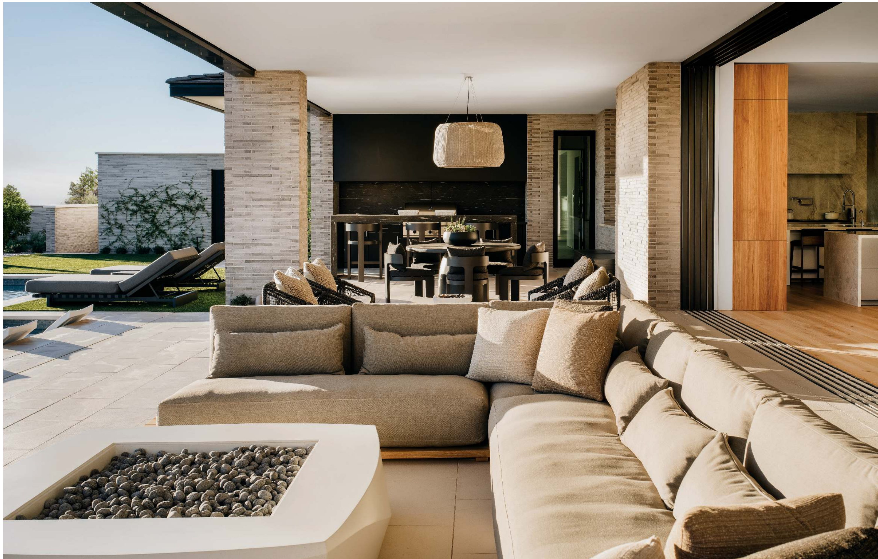
In an outdoor seating area adjacent to the living room, a Montauk Sofa sectional wraps around a Lumacast concrete fire table. Just beyond, a Bover pendant from Lightform Lighting illuminates an RH dining table and Harbour chairs.