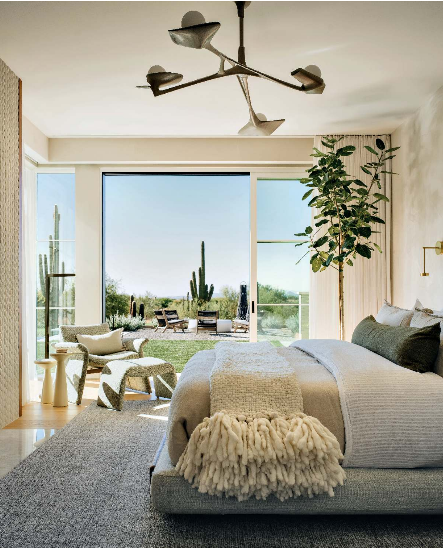
Opposite: Krasnogorov Studio's Pearl Chandelier crowns the primary bedroom, which is clad in an ivory suede wallcovering by Phillip Jeffries. Positioned for prime views, a Riva 1920 bed from Haute Living dressed in Parachute linens is joined by a Verellen chair and ottoman.