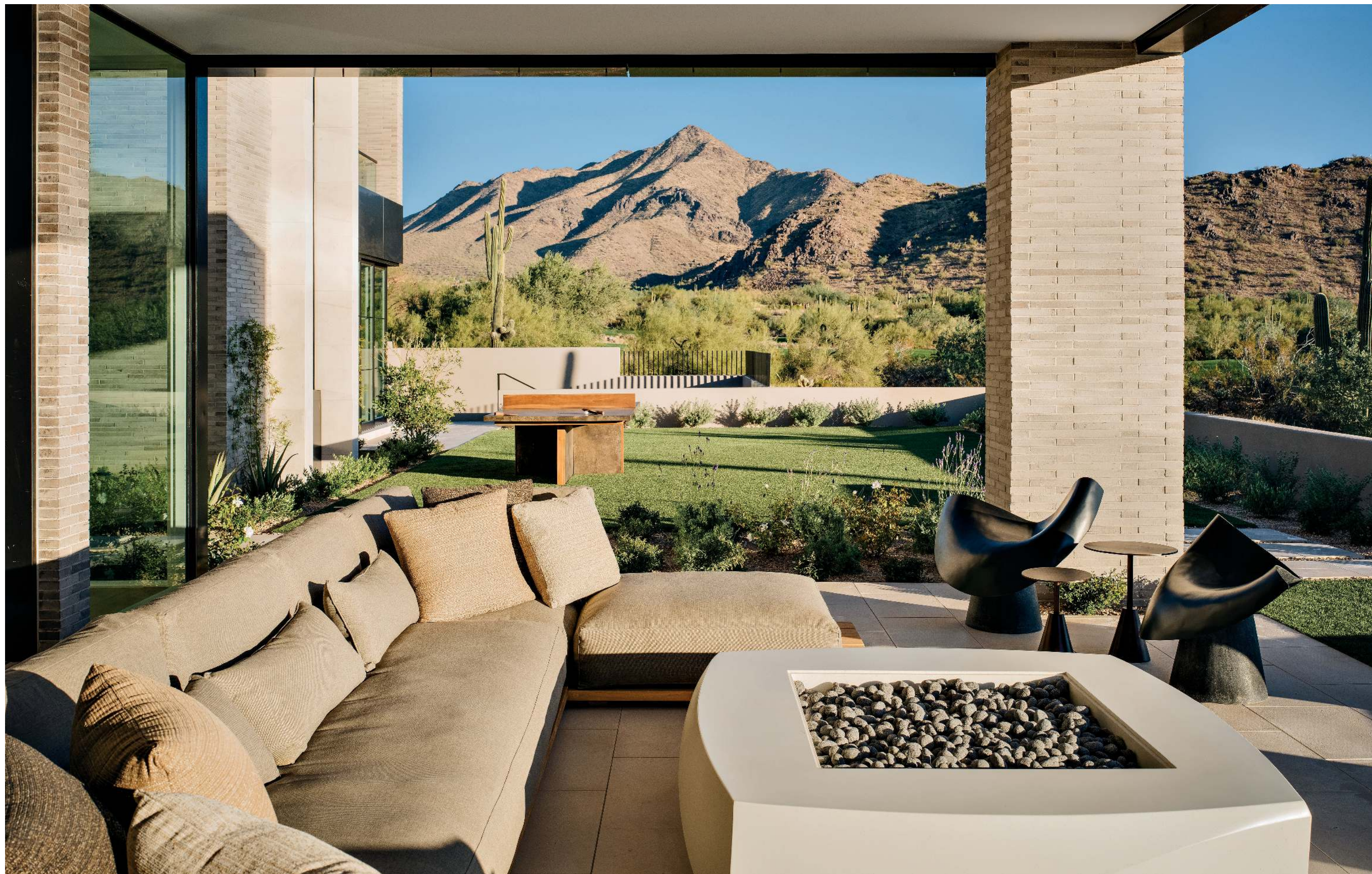
Black chairs by Imperfettolab act as both artwork and additional patio seating. On the lawn, an Arhaus Ping-Pong table invites play while giving the illusion of a sculpture carved from rock.