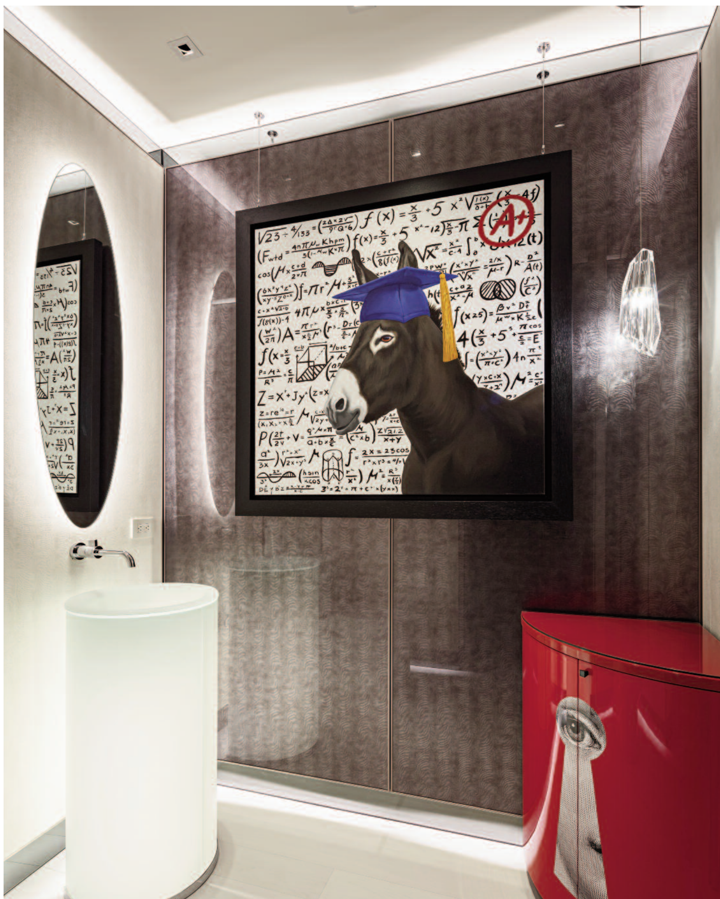
Pullman Vitraform™ pedestal sink.

As the marketing crew proudly exclaims, “This award-winning mixed-use development has become the gathering place for the surrounding areas of Northeast Phoenix and Scottsdale. This boutique community has 84 exclusive residences offering homeowners a one-of-a-kind real estate opportunity that blends life, work, and play. Landscaped terraces, courtyards, and a pool deck that connect two buildings, along with on-site concierge staff and property management, a pet park, outdoor kitchen, heated lap pool, dining and barbecue areas, two community lounges, a professional fitness studio, reserved parking in the private garage, VIP Resident Discounts and secure card access to create the perfect lifestyle experience!” What better place to entertain out-of-town guests, or treat family to the ultimate stay-cation?