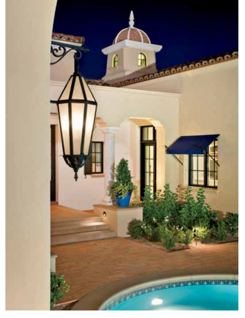
A brick-accented tower provides both dimension and intrigue. Landscape designer Jeff Berghoff carefully incorporated a mix of path lights, spotlights and accent lighting for the outdoors. Pine-framed windows and doors offer a sharp contrast to the home's soft-toned stucco exterior.