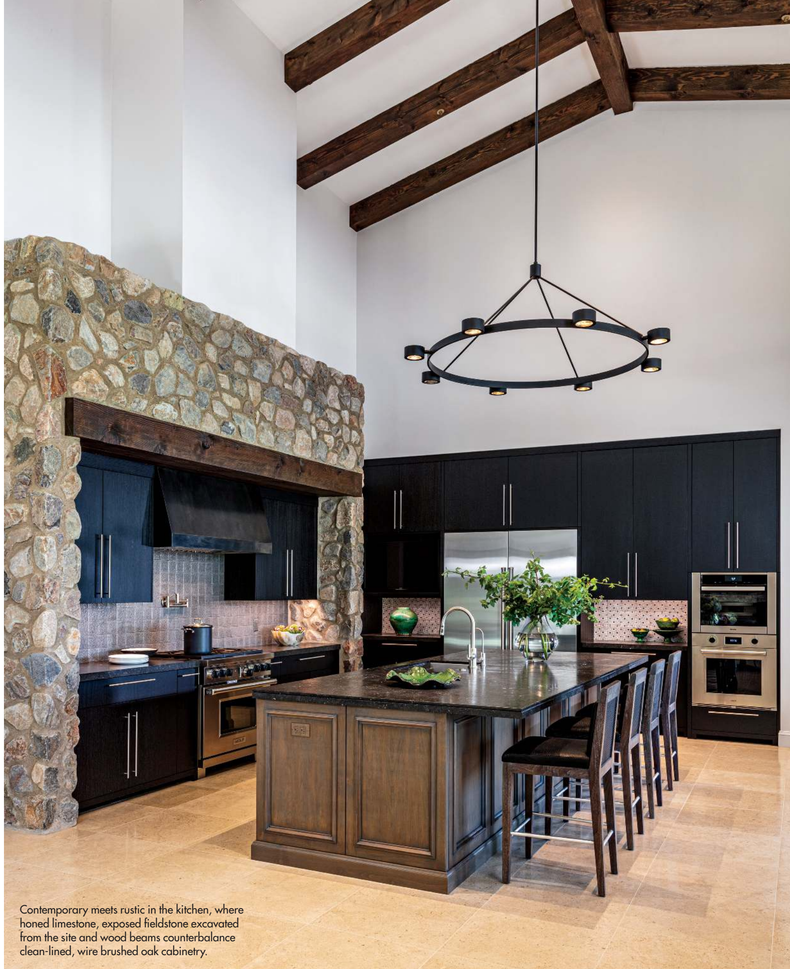
Contemporary meets rustic in the kitchen, where honed limestone, exposed fieldstone excavated from the site and wood beams counterbalance clean-lined, wire brushed oak cabinetry.

“We were trying to go after a rustic charm that felt as though it still had some warmth to it but with the addition of modern amenities.”