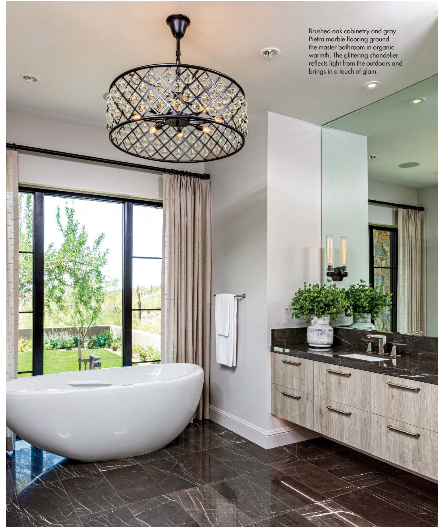
Brushed oak cabinetry and gray Pietra marble flooring ground the master bathroom in organic warmth. The glittering chandelier reflects light from the outdoors and brings in a touch of glam.