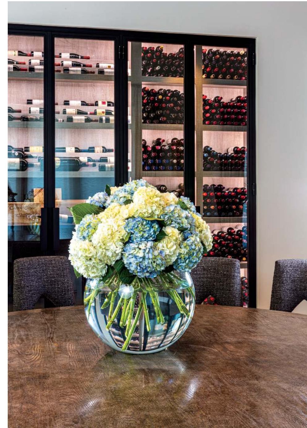
Simple touches of greenery, such as this bouquet of hydrangeas displayed on the circular dining table in a glass orb, enhance the subdued interiors. The chairs' chenille-like fabric adds texture to the setting.